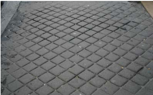
A pavement in Paris

After the very successful launch of the World Map rug by Barnaby Barford in the autumn of 2007, we are proud to announce the arrival of the second rug into the thorsten van elten collection.